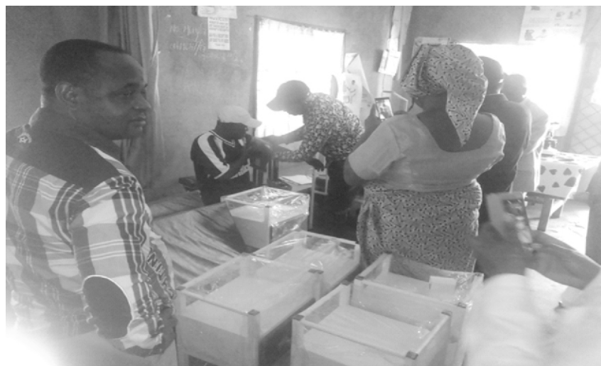
(The Reception Committee, for the reception of medical equipment. The DOM for Bamenda Health district actively doing a test of equipment)

Office and the Construction of a Veterinary and Zoo-Technical Center at Ntamulung, Mankon-Bamenda.